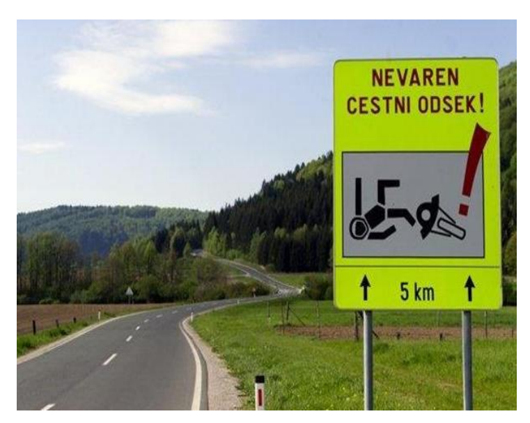
Figure 5. One of eight preventative information boards that are not included in the Slovenian Traffic Signalling Rulebook

Improved road/roadside safety conditions can be accomplished through the implementation of physical measures. The aim of such physical elements is to achieve a higher level of safety on the road and particularly in areas directly next to roads (roadside). These measures are also called infrastructure safety improvements; motorcycle-friendly roadside barriers (Fig. 6.) represent just one of these measures.