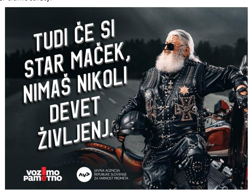
Figure 4. An example of a Slovenian prevention billboard for 2018

Preventive awareness campaigns and additional education are considered a 'long-term investment', as the positive consequences are only visible after an extended period. This measure includes the production and distribution of promotional flyers, brochures and posters (Fig. 4.) containing precautionary contents in order to promote better traffic safety.