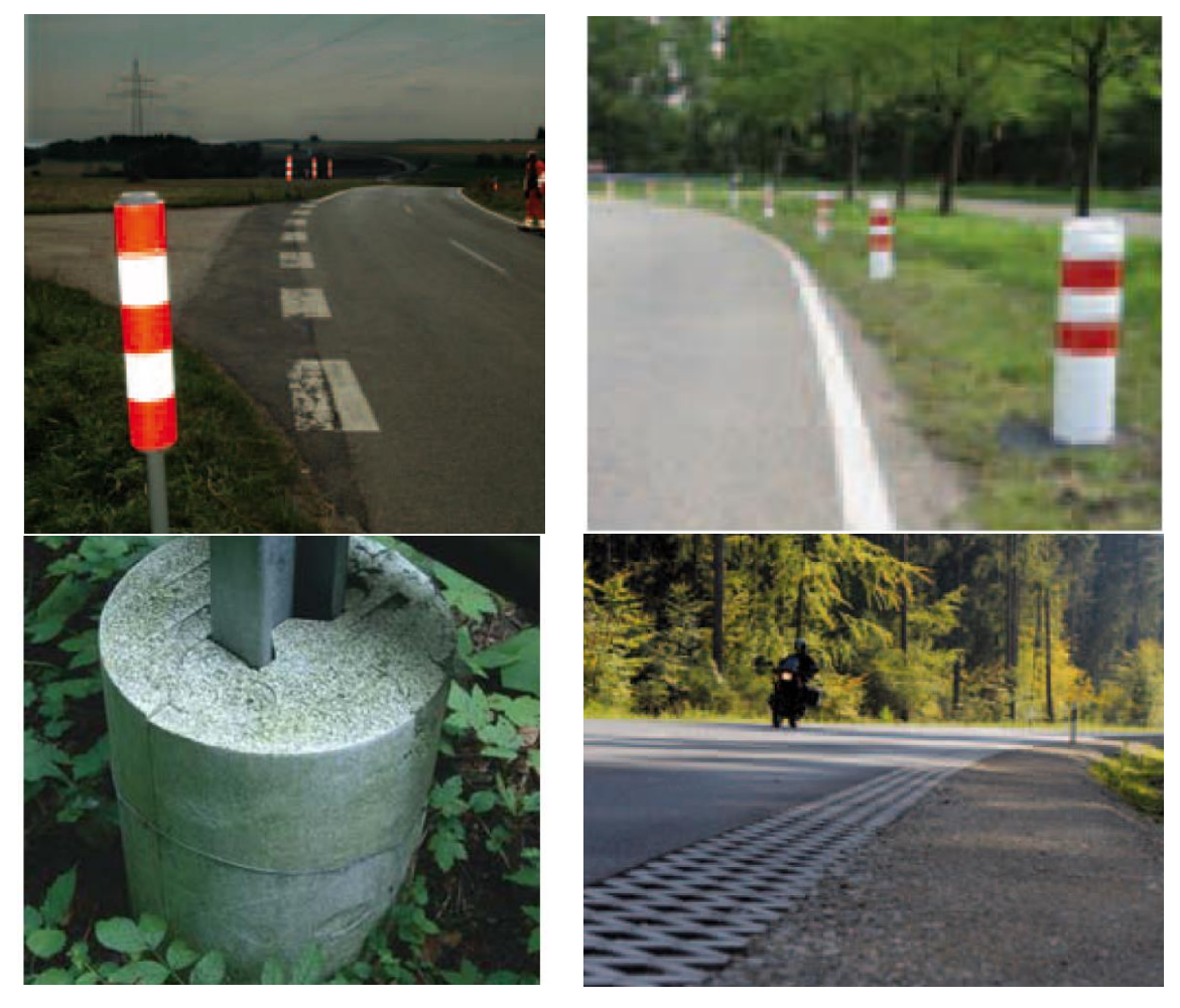
Figure 8. Some of the measures provided in the Slovenian specification in the road equipment phase; from upper-left: flexible bollards, flexible 'balisette' bollards, motorcycle collision shock absorbers and a reinforced shoulder between the pavement and the slope of the embankment

In the Slovenian infrastructure guidelines for PTWs in the road maintenance phase the following situations/locations/elements are defined as dangerous and need to be eliminated as soon as possible: