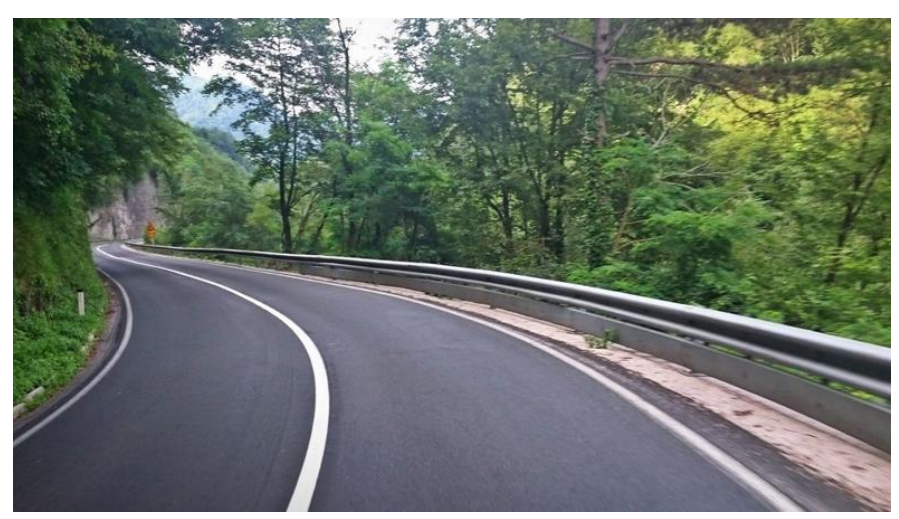
Figure 6. Motorcycle-friendly roadside barriers

Improved road/roadside safety conditions can be accomplished through the implementation of physical measures. The aim of such physical elements is to achieve a higher level of safety on the road and particularly in areas directly next to roads (roadside). These measures are also called infrastructure safety improvements; motorcycle-friendly roadside barriers (Fig. 6.) represent just one of these measures.